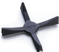
Cast iron wok support 9601 668